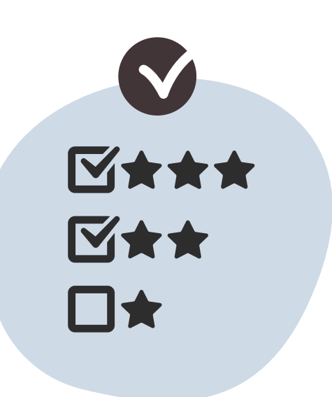
I have a good sense of our external employer brand (Glassdoor, Indeed, Muse)