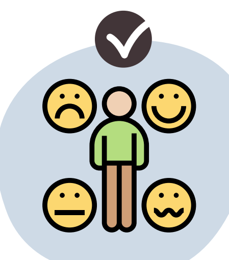
If someone spent a day at our office or in a virtual meeting they would feel our culture