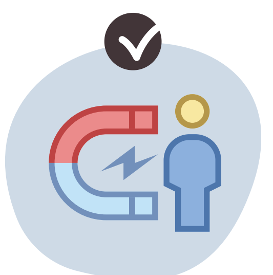
Our company culture attracts and helps to retain top talent

and-marketing.com workplaceharmonyhr.com