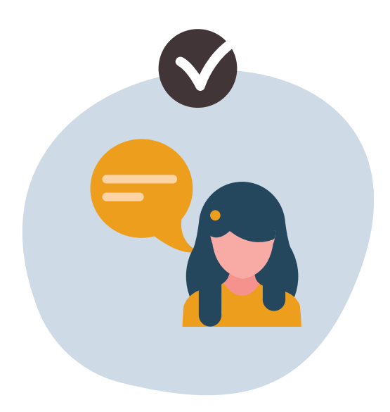
Employees can easily and concisely describe our company culture